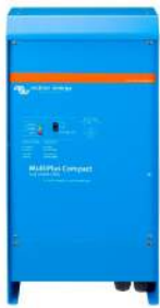
MultiPlus Compact 12/2000/80

After installation, the MultiPlus is ready to go. If settings have to be changed, this can be done in a matter of minutes with a new DIP switch setting procedure. Even parallel and 3-phase operation can be programmed with DIP switches: no computer needed! Alternatively, VE.Net can be used instead of the DIP switches. And sophisticated software (VE.Bus Quick Configure and VE.Bus System Configurator) is available to configure several new, advanced, features.